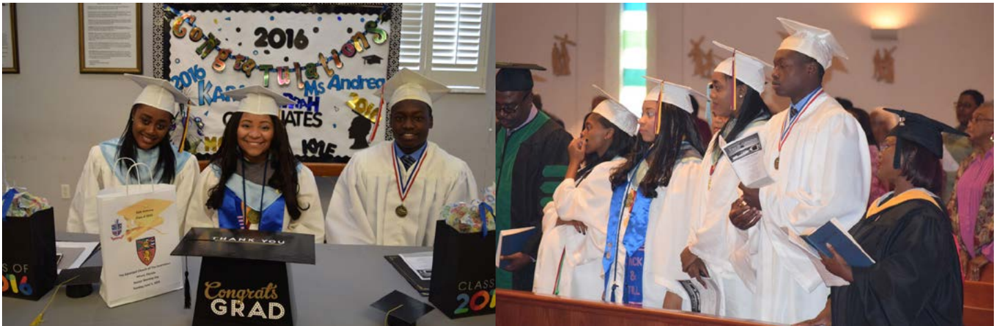
Graduate Recognition Sunday