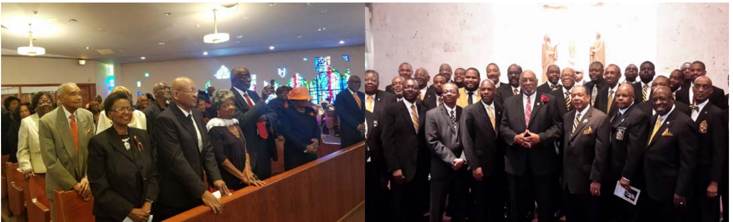
Class Reunion Worship with the Incarnation Family