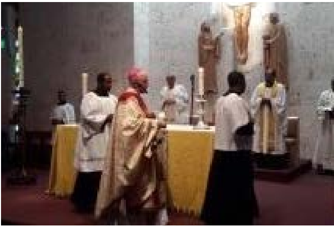
Bishop Eaton celebrating Mass with Us