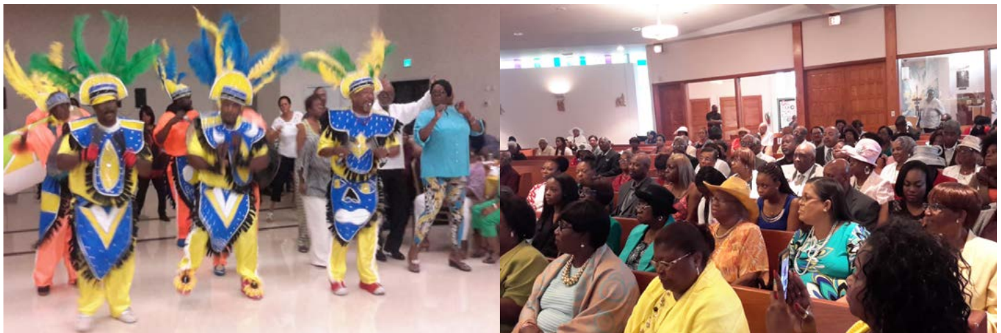
Pre-Mother's Day Dance