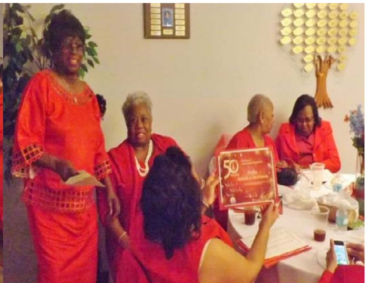
Hosting Community Award Program in the J. Kenneth Major Parish Hall