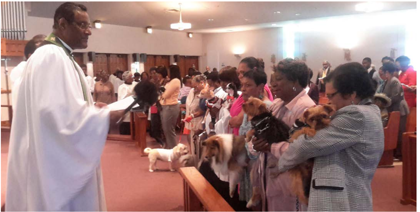
Blessing of the Animals