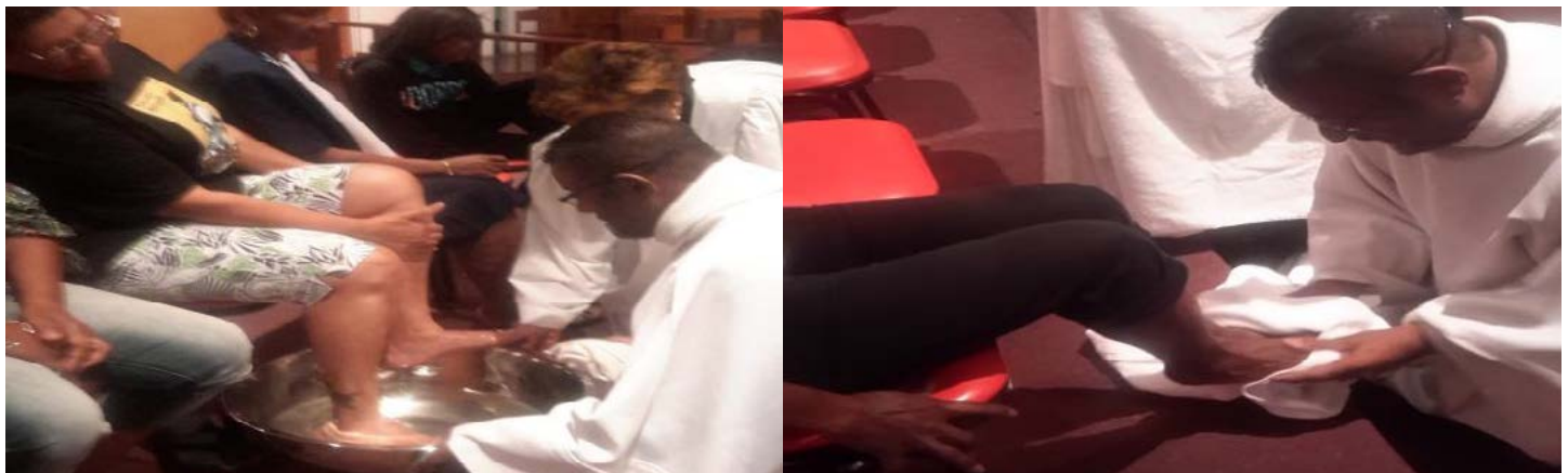
Maundy Thursday, Washing of Feet