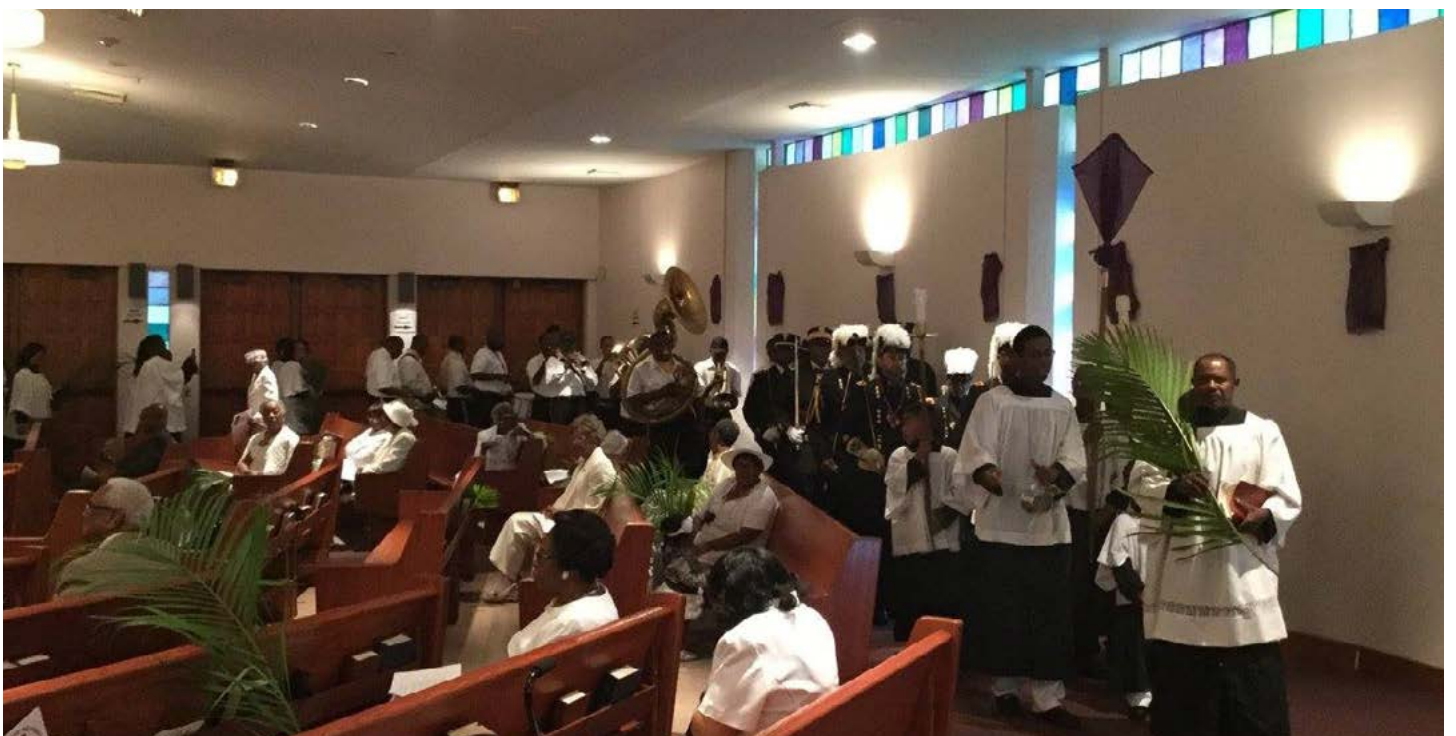
Palm Sunday Procession