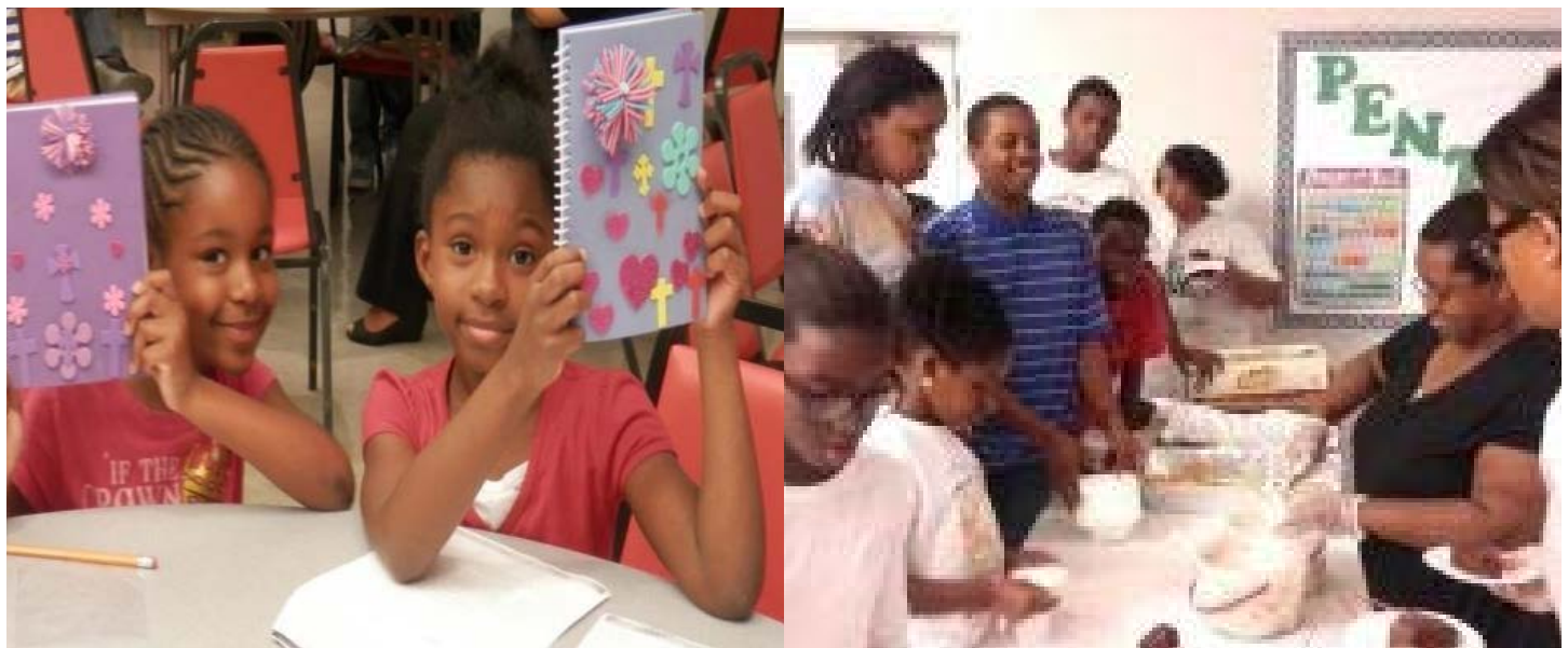
Hosting and supporting community activities.