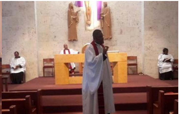
The Bread of Life